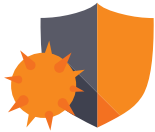
Antivirus & Anti-malware

Avast delivers easily managed cloud-based and on-premise business security solutions for PCs, Macs, and servers. We protect more than 230 million endpoints globally, which provides your organization with the most-trusted security in the world.